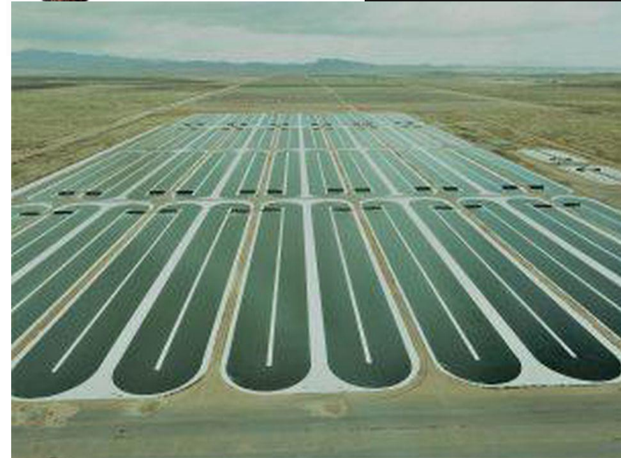
A Qualitas Health farm in Columbus, New Mexico, 52.8 acres of algae.